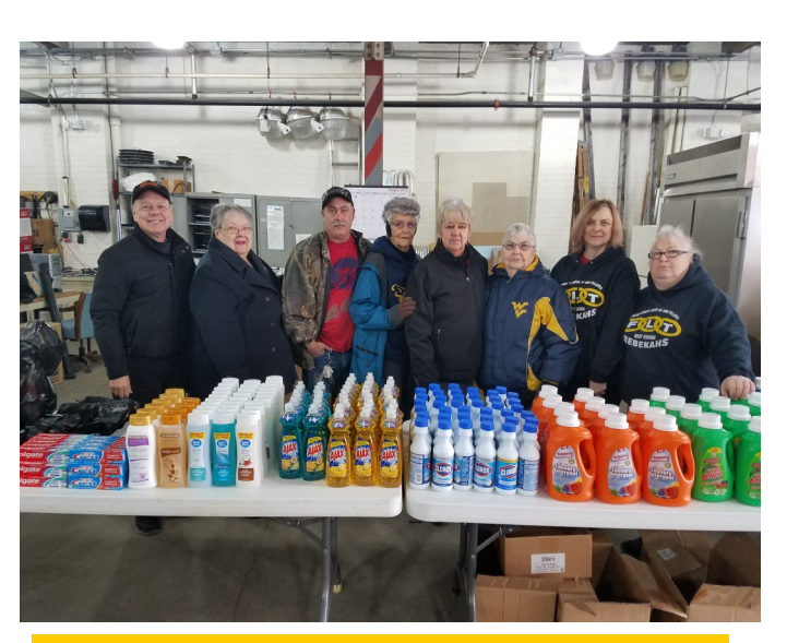
Member Breakfast a la carte bar from 8:15am - 9:45am